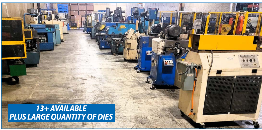
PARTIAL VIEW OF TUBE END FORMERS & DIES