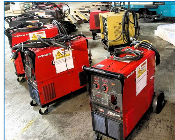
PARTIAL VIEW OF LINCOLN ELECTRIC WELDERS