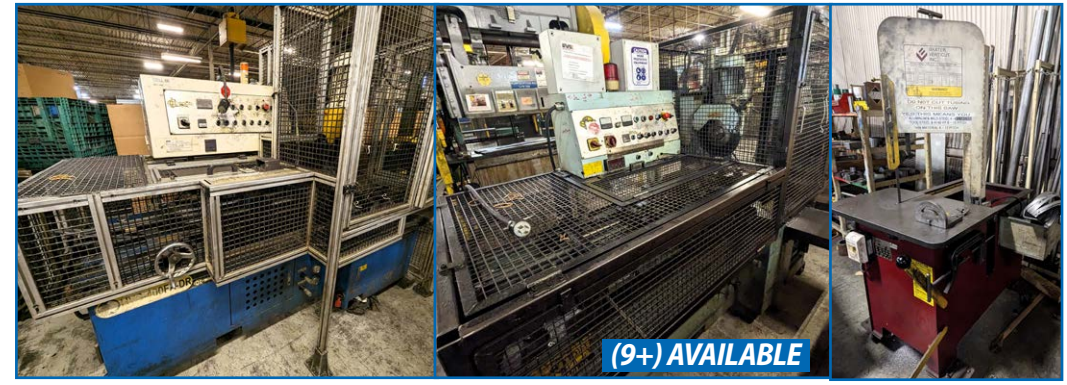
PARTIAL VIEW OF SAWS