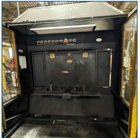
PANASONIC ROBOTIC WELDING CELL