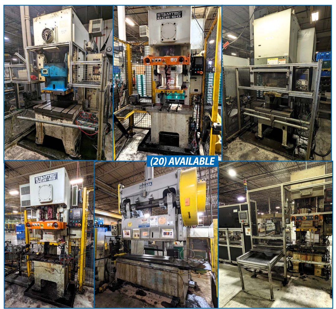
PARTIAL VIEW OF STAMTEC, KOMATSU, BLOW, FEDERAL, BROWN BOGGS PUNCH PRESSES