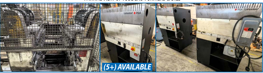
PARTIAL VIEW OF DEBURRING MACHINES