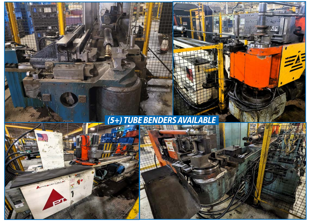
PARTIAL VIEW OF TUBE BENDERS