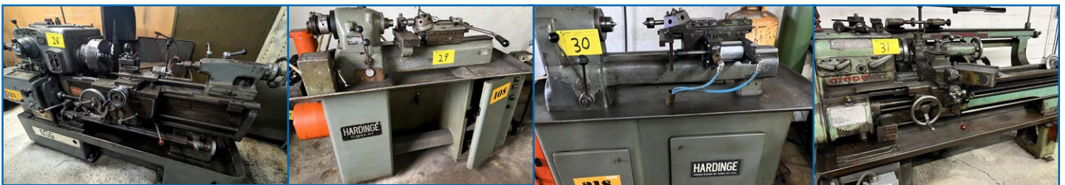
PARTIAL VIEW OF LATHES

HMT FN2EH Horizontal Milling Machine, 40 Taper, 8" x 48" Table, s/n 1777