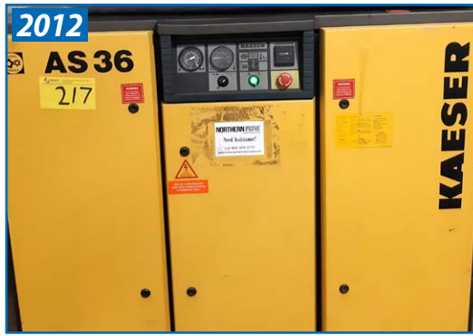
KAESER AS 20 COMPRESSOR