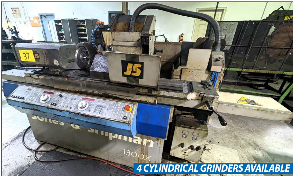
JONES & SHIPMAN 1300X CYLINDRICAL GRINDER

WELLS Horizontal Bandsaw w/ Outfeed Roller Conveyor