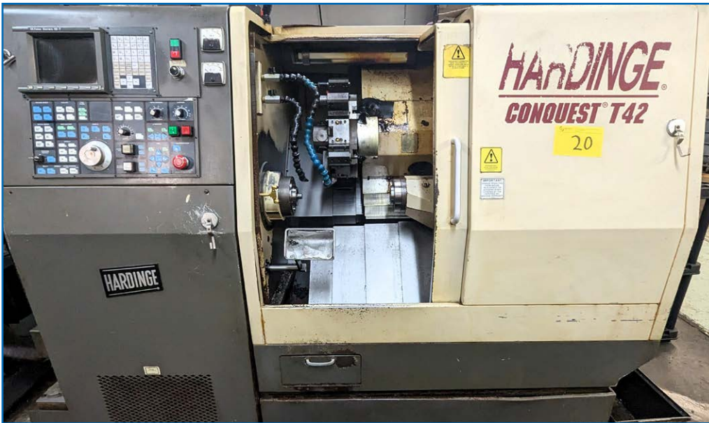
HARDINGE CONQUEST T42 CNC TURNING CENTER