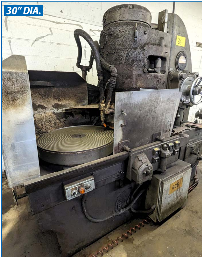
BLANCHARD ROTARY SURFACE GRINDER