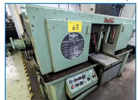
DOALL C-8A BANDSAW