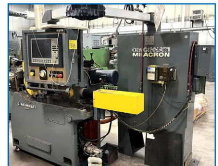
CINCINNATI MILACRON ML CNC CENTRELESS GRINDER