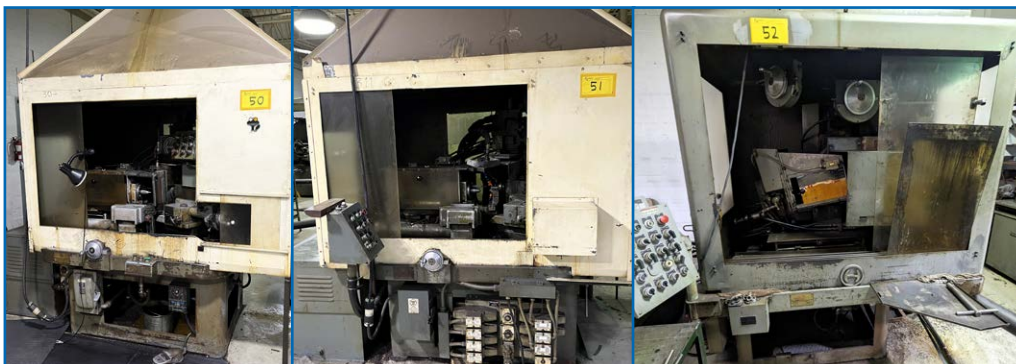
PARTIAL VIEW OF CHAMFER & FLUTING MACHINES