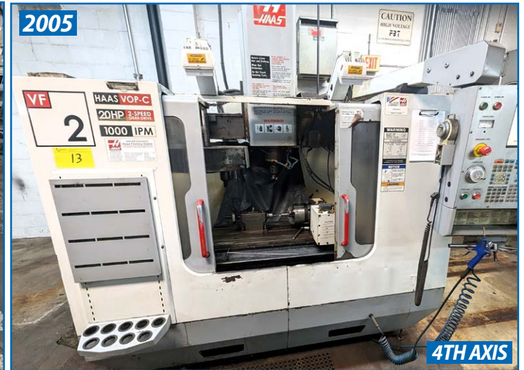
HAAS VF-2B CNC VERTICAL MACHINING CENTER