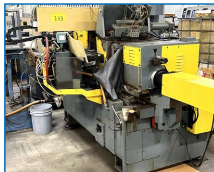
CINCINNATI MILACRON 220-8 CENTRELESS GRINDER