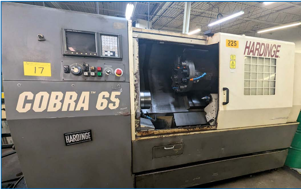
HARDINGE COBRA 65 CNC TURNING CENTER