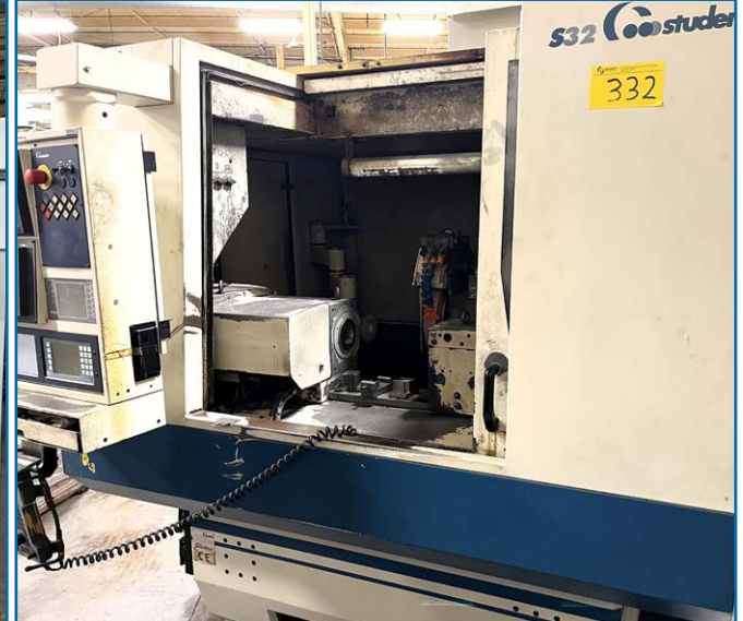
STUDER S32 CNC CYLINDRICAL GRINDER