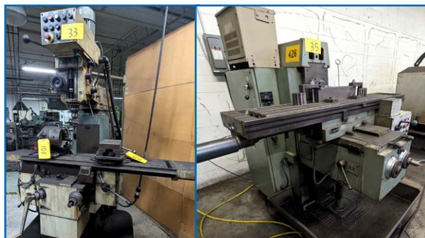
PARTIAL VIEW OF MILLING MACHINES