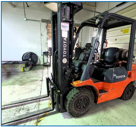
TOYOTA 42-7FG25 PROPANE FORKLIFT