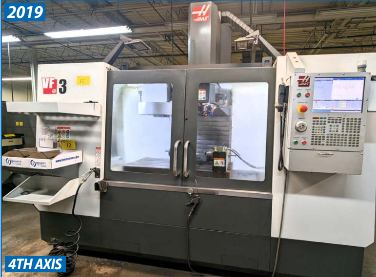
HAAS VF-3 CNC VERTICAL MACHINING CENTER

1297 Industrial Road, Cambridge (Toronto), Ontario