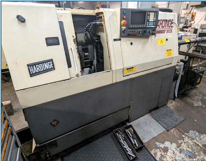
HARDINGE CONQUEST ST25 GANG TOOL CNC TURNING CENTER